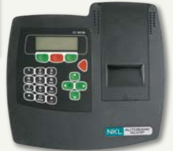
NKL AutoBank® XLViP Controller